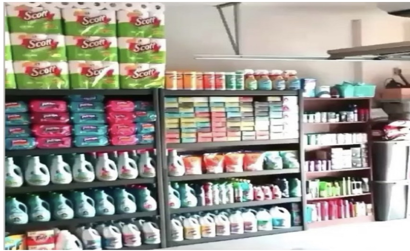
Check out this picture of the garage from last week.

We started couponing the same way many people do – with too much month and not enough money.